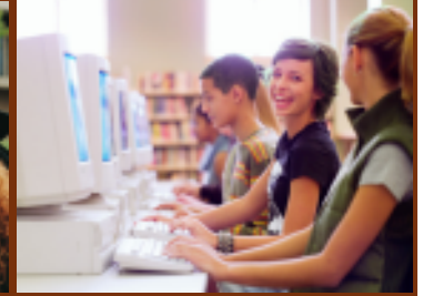
Haverhill High School Counseling Department